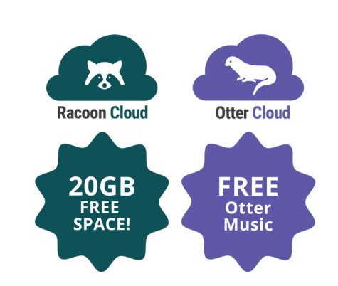
Shop around when looking for a cloud service provider