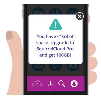
Pop up ads from your cloud service usually mean you're running out of storage